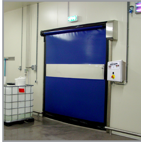
RapidCoil RC100 - High Performance