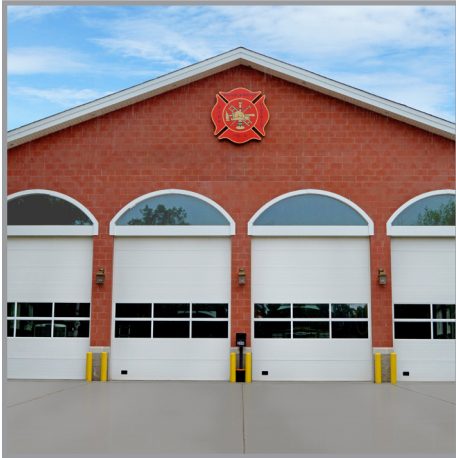
TM300 - Commercial Sectional

Raynor also offers a full line of sectional, rolling, high performance and traffic doors as well as security grilles. See your Raynor Dealer or visit www.raynor.com for more information.