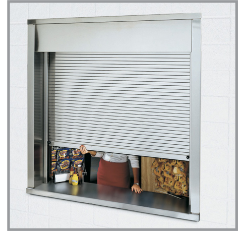
DuraShutter - Rolling Doors and Shutters