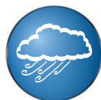
Ultra Tight Bead Seal

15" vision banner standard. 24" x 24" individual windows and bug screens are optional.